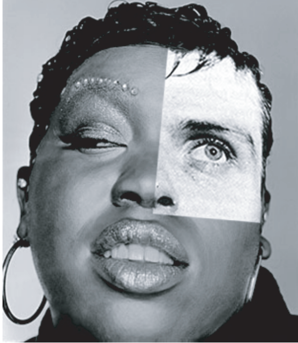
'Missy Curtis': Love Will Get Ur Freak On